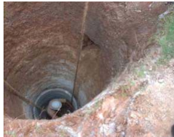
Placing of the rings