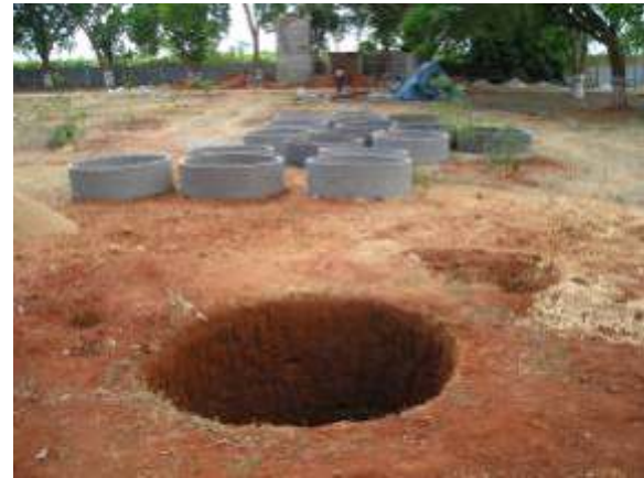
Pit and concrete rings