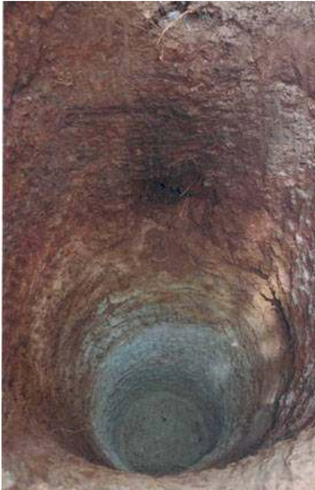
The pit has reach the silt layer

Pack the pit with 1" thick layer of boulders. Place the rings one above the other in the pit.