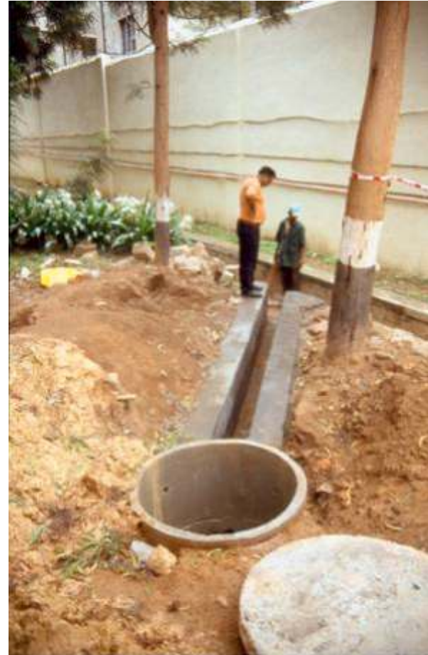
Recharge wells for storm water