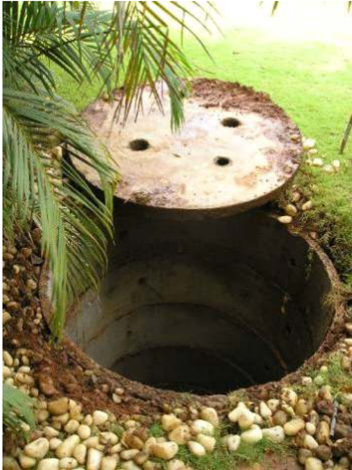
Well with perforated concrete cover

Make a trap so that silt and leaves are removed before water enters recharge well. It can be a cubic hole in the drain, so that the big particules sediment.