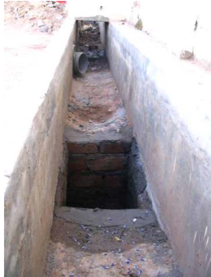
Silt and leaves trap in a stormwater drain