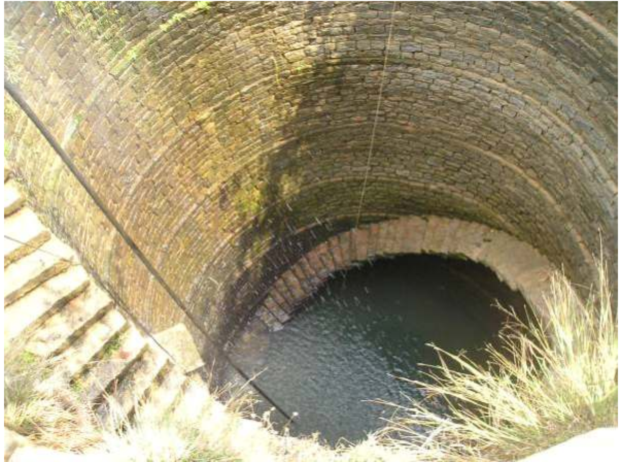
A magnificent open well

If you are building on a new site do not forget to consider digging an open well. No, it need not be like this magnificent stone structure. It can be of RCC rings, only a metre in diameter and about 6 metres deep