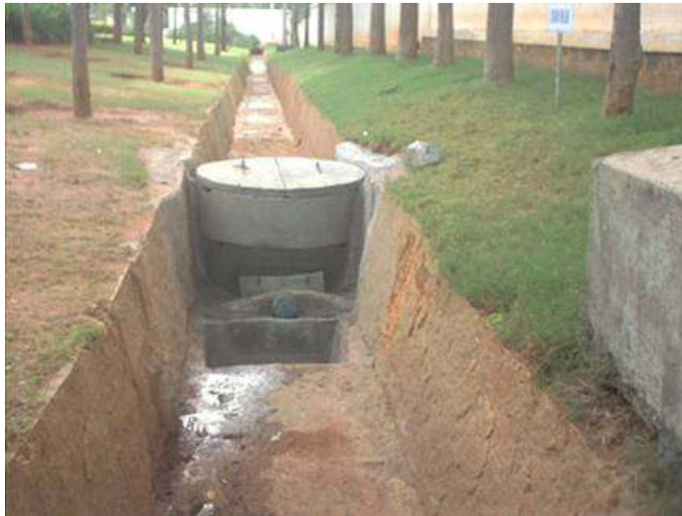
Covered recharge well in a storm water drain

Digging a new well costs around Rs 8,000/- to Rs 12,000/- depending on the diameter and depth.