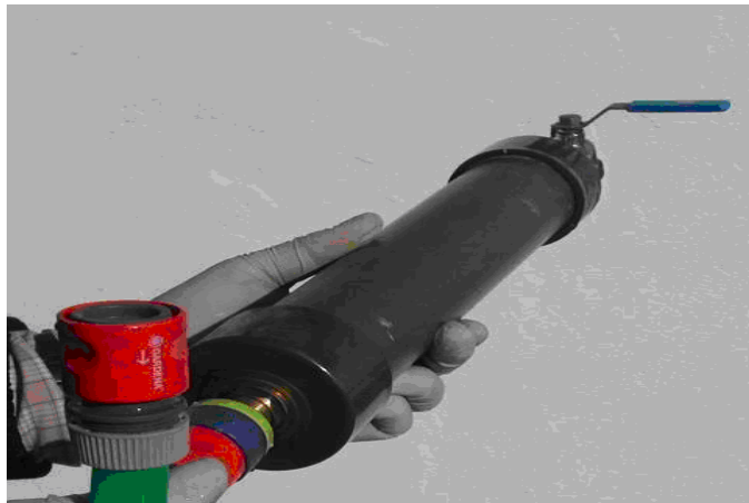
1" INLINE UNIT

This is a filter ½" the Mini, It connects with a water outlet tap and it purifies 5 litter water min, measured at 3 atm. It can be captured and distributed or transported in bottles after the purification process.