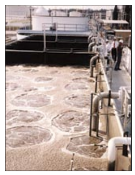
FIGURE 3. Jet aerators provide microorganisms with the necessary aeration while maintaining the suspension of biological solids without the need for additional equipment.

greater levels of treatment. Regardless of the type of system selected, one of the keys to effective biological treatment is to develop and maintain an acclimated, healthy biomass, sufficient in quantity to handle maximum flows and the organic loads to be treated. Maintaining the required population of "workers" in a bioreactor is accomplished in one of two general ways: