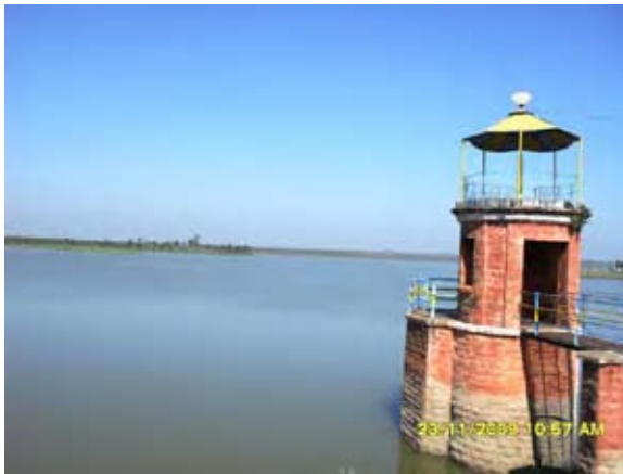
The 100 years old Nagchun Talab which has been neglected in favour of new PPP project pumping water from 52 KMs for supply to Khandwa town.