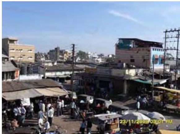
A market in the mofussil town of Khandwa.