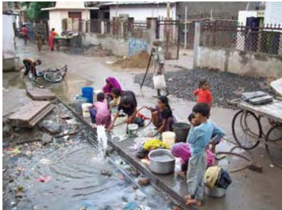
Water supply in a low income locality in Indore.

In such diverse settings, therefore, the implementation of PPPs requires careful examination and evaluation. Privatising water and sanitation services could deprive a large number of people from a vital source of life and a human right. Privatised water supply projects in places like Nelspruit and Capetown in South Africa, Manila in the Philippines and El Alto and La Paz in Bolivia have shown the general unwillingness of the private operators to extend water connections to poor areas because of the higher connection