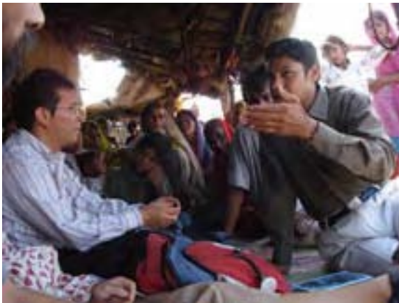
A community consultation during Reclaiming Public Water yatra in Indore in 2007

Similar is the case with the DMAE, Porto Alegre, Brazil, where the tariff system is progressive: "people who use water only for basic needs (consumption up to 20 cubic meters per month) are strongly subsidised by people who use between 20 and 1,000 cubic liter per month. Tariffs in the second rate go up exponentially and after this it is very expensive. With this tariff structure we are able to do all of our investments in maintenance and expansion of the water and sanitation services. This tariff structure allows us to generate yearly a surplus of about 20-25 percent of our annual budget, which goes straight to new investments". 131 The DMAE is publicly owned, but financially independent of the state, self-financed