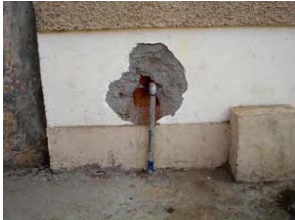
Poor installation work done by the private operator in Nagpur's Dharampeth zone.

A 2009 Public Private Infrastructure Advisory Facility (PPIAF) study tries to address the debate on the improvement in performance of water and electricity distribution using the private sector participation (PSP) model "using a data set of more than 1200 utilities in 71 developing and transition economies. The sample includes 301 utilities with PSP and 926 state-owned enterprises (SOEs) over more than a decade of operation". 43 On PSP in water and sanitation sector, the study asks a question, "Because