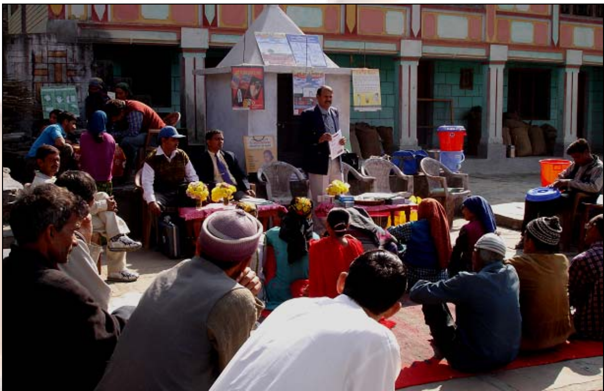
WATER - THE EXILIR OF LIFE: Lecture cum Demonstration on Safe Drinking Water