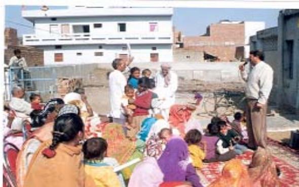
Awareness and Training Programme