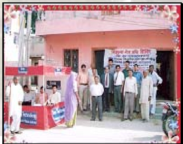
Eye Camp on progress