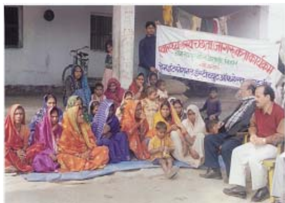
Training to women on health and hygiene