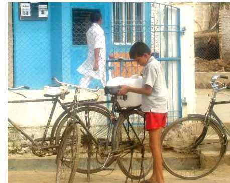
Easy access of safe water to community

A community – owned water purification model that facilitates Public Private participation to deliver safe water at Price affordable to the community