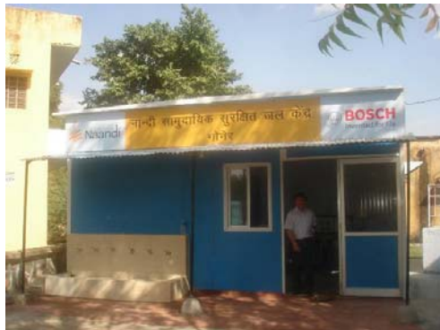
Safe drinking water center