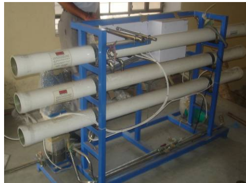
Water processing unit ( RO )