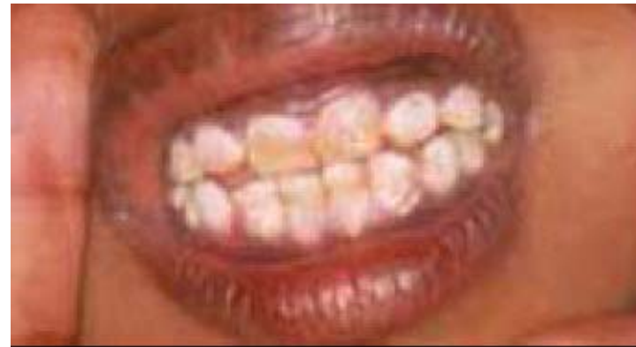
Dental Fluorosis among the children